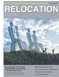
Download our Relocation Guide