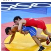
Olympic omission bodyslams wrestling association