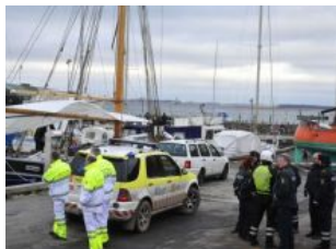
students who fell in freezing water on school boat trip