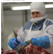
Horsemeat scandal reaches Danish company