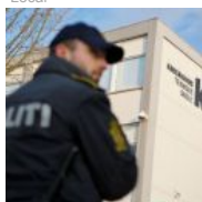
More arrests on the way in multiple stabbing cases