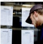
Government surpasses jobs goal