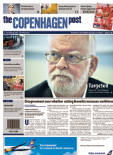
Read this week's Copenhagen Post