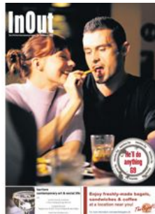
Read this week's InOut section